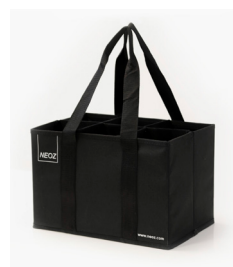
Handling Accessory 6 Lamp Carrier (Optional)