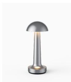
Anodised Silver Aluminium