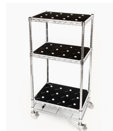
Medium Recharging Station 36 Lamps