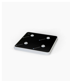
Small Recharging Tray 4 Lamps