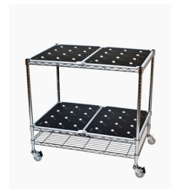
Large Recharging Station 48 Lamps