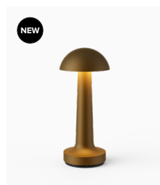
Anodised Sandblasted Bronze Aluminium