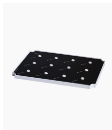
Large Recharging Tray 12 Lamps