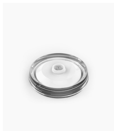
Single Lamp Charger 1 Lamp