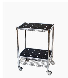
Small Recharging Station 24 Lamps