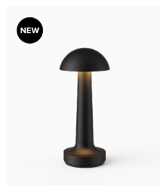
Anodised Sandblasted Black Aluminium