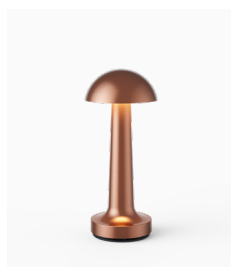
Lacquered Real Copper